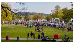
SLOTTSSKOGEN Terrain running events venue