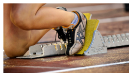
BJÖRLANDA ATHLETICS Training and additional venue