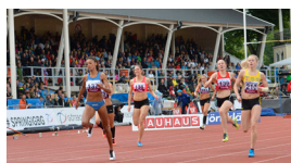
SLOTTSSKOGSVALLEN Primary stadia venue